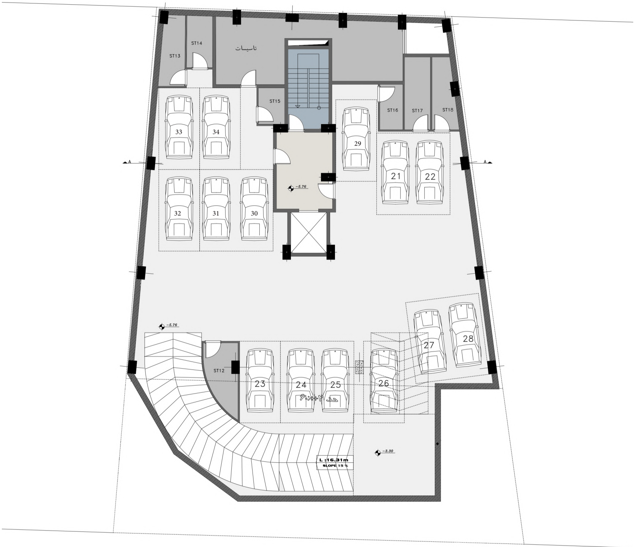
-2 BASEMENT FLOOR PLAN