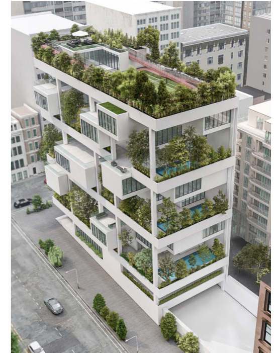
| Birdeye View

This project tries to define and offer a new concept of living in an apartment building. Although its face and function are completely new, it has a strong dependency on its past. Most residents of this building used to live in villas or houses. as you might know the sense of living in a villa is completely different from living in an apartment building. the villa is completely covered with green spaces although there is not a wide range of facilities, and most villas are located in the suburbs, so its residents have difficulties for the commute, such as a long distance to the city center and a traffic jam at the entrance of the city