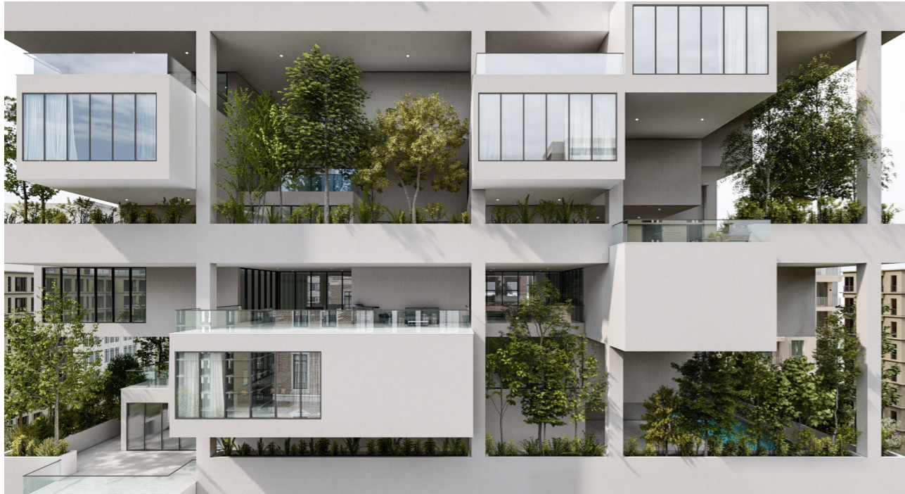
| West Faced