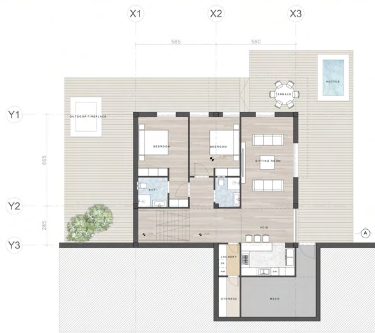
-1 Floor Plan